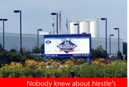
Nobody knew about Nestle's proposal to pump more groundwater because the only notice was posted on a government website

We behave differently on the internet. We tend to be goaloriented, visiting websites for a particular reason. Although digital interfaces at their best encourage serendipity, it tends to be unidirectional<sup>20</sup> and is often focused on the sensational<sup>21</sup>. Public notices don't stand a chance in that environment; they get lost and are easily hidden. Moreover, the massive migration from desktop computers to small-screen mobile devices has exacerbated the problem.