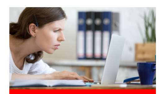
People search for specific information on the internet and tend to ignore what they aren't looking for

Two recent examples highlight the danger of publishing notice only on government websites.