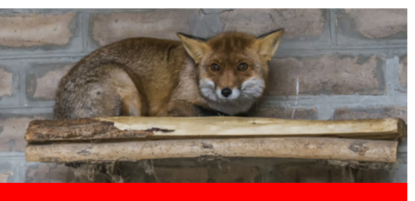
Moving public notice to government websites would be like hiring foxes to guard the henhouses

rest of the country.<sup>44</sup> There are also fewer broadband providers operating in rural areas so consumers there tend to have limited options when subscribing to high-speed services.<sup>45</sup>