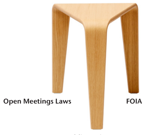
Public Notice Laws