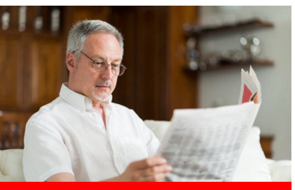
Reading a newspaper, people discover things they didn't expect to see

Newsprint is inherently superior to the internet for disseminating public notice Although web publication of notices should be encouraged—more notice is always better notice—intrinsic differences between the print and online experiences make newsprint a superior medium to the internet as a source of public notice.